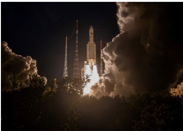
Successful launch of Ariane 5.