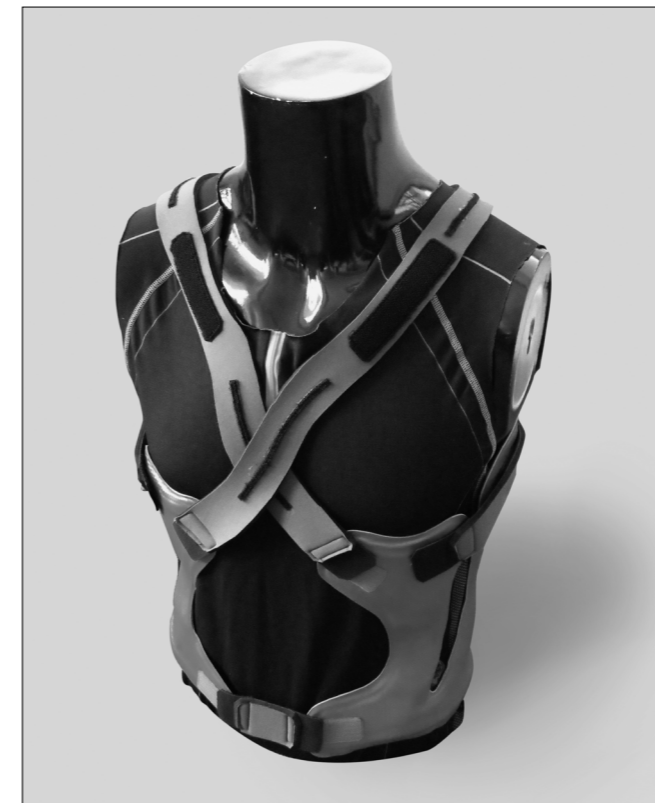
The CareJack vest supports the back without restricting freedom of movement.